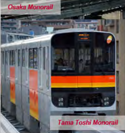
Tama Toshi Monorail