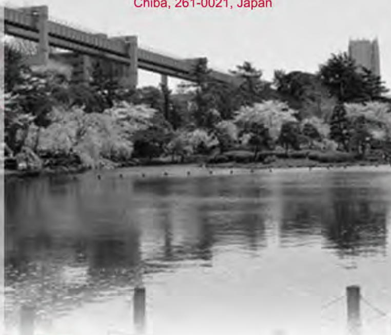
Chiba Park Chiba, Japan

2 Chome-10-1 Hibino, Mihama-ku, Chiba City, Chiba, 261-0021, Japan